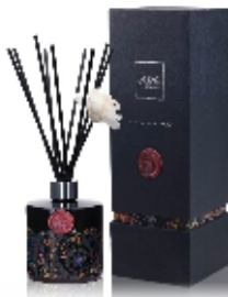
Ambiance Perfume Diffuser 250ml