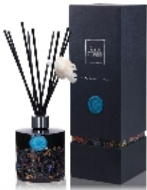
Ambiance Perfume Diffuser 250ml