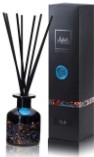
Ambiance Perfume Diffuser 100ml