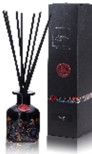
Ambiance Perfume Diffuser 100ml