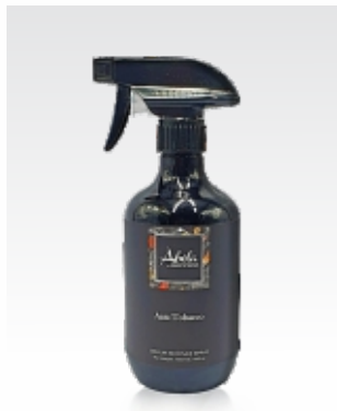
Anti Tobacco Odour Remover Spray