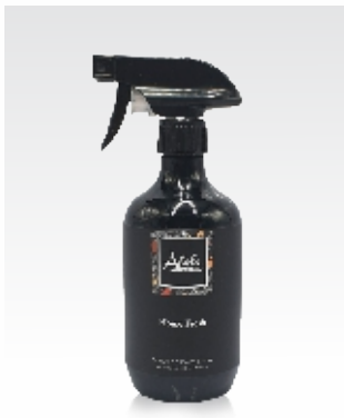
Home Fresh Odour Remover Spray

Get rid of bad odour. Keep your home smelling fresh