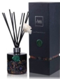
Ambiance Perfume Diffuser 250ml