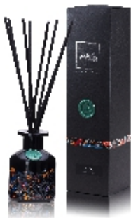
Ambiance Perfume Diffuser 100ml